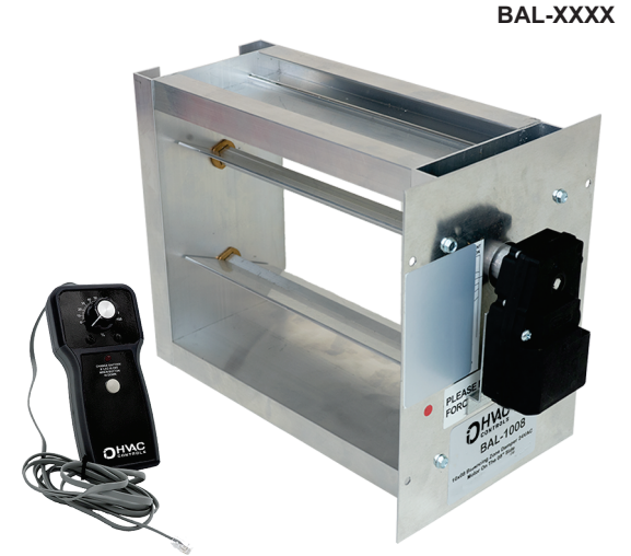
BAL-C REMOTE CONTROL POSITIONER