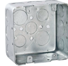
EXAMPLE OF DOUBLE GANG JUNCTION BOX (BY OTHERS)